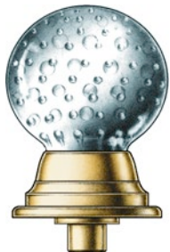
1 1/4" Crystal Cabinet Knob Shown with Type II Shell Shank