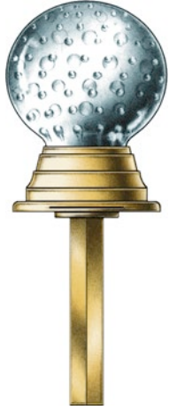
Crystal Thumbturn and Rose