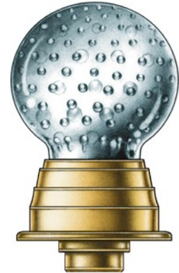
1 5/8" Crystal Knob Shown with Type I Shell Shank